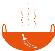
Tom yam soup