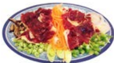
T1 Beef teppan