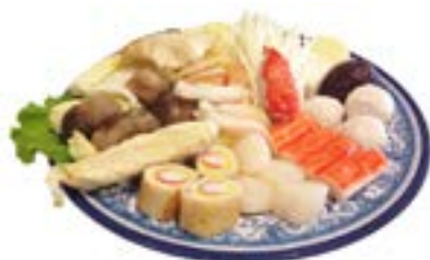
S1 Yosenabe special