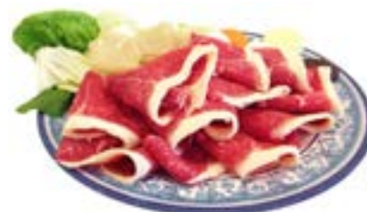
Y3 New Zealand beef