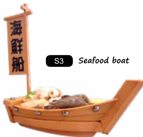
S3 Seafood boat