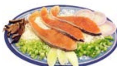
T6 Salmon Teppan