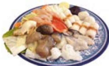
S2 Japanese special